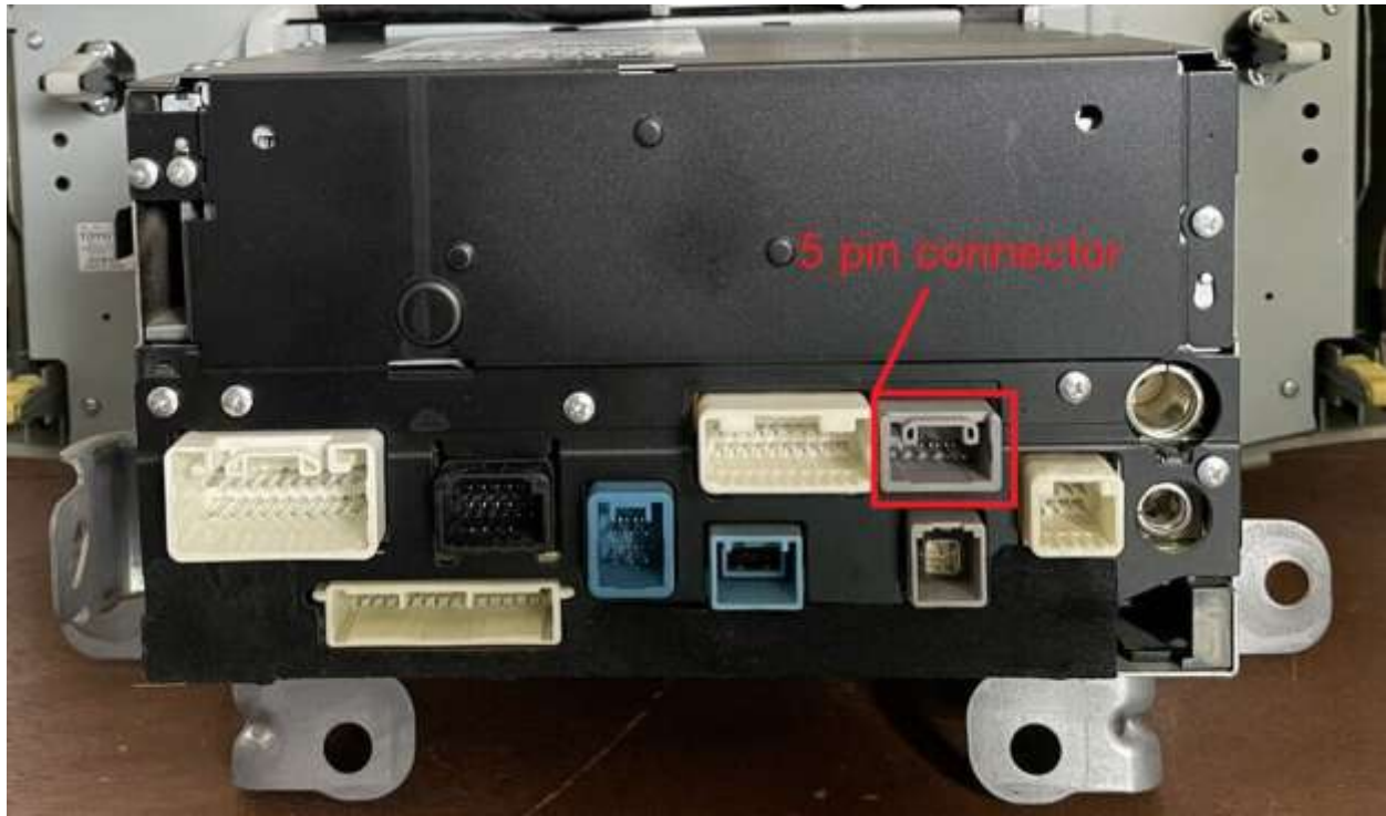
Example of 5 pin location